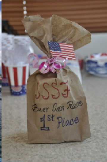
Raft Up Party and Trophies